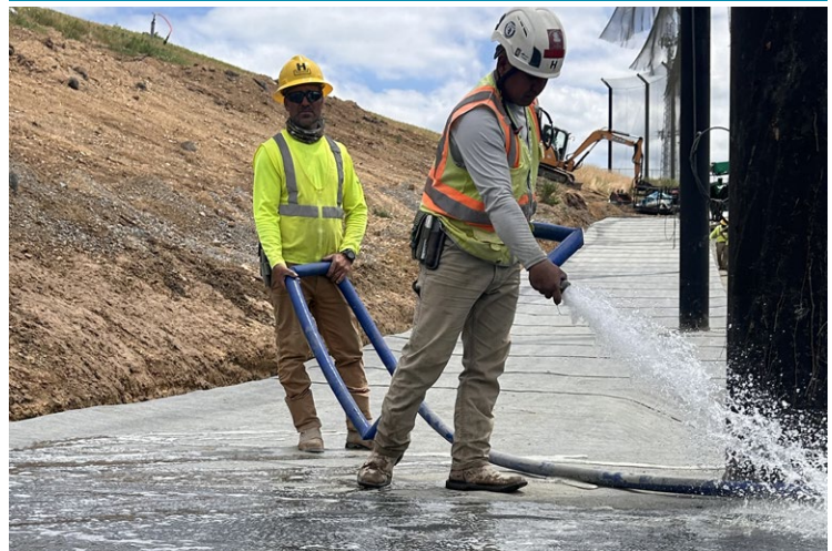
CCX-M ® hydration taking place