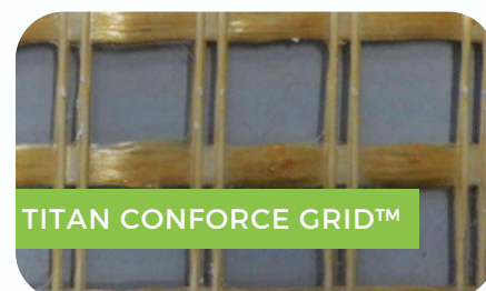
TITAN CONFORCE GRID™