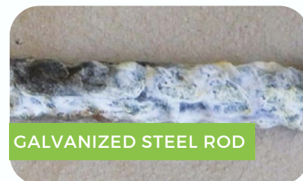
GALVANIZED STEEL ROD