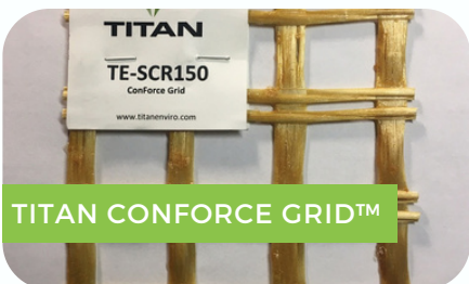
TITAN CONFORCE GRID™