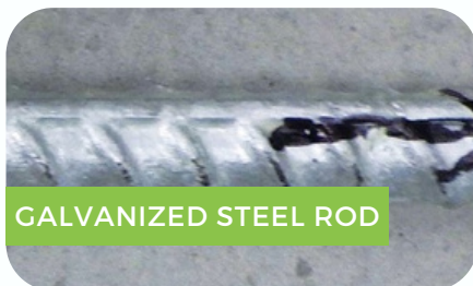
GALVANIZED STEEL ROD