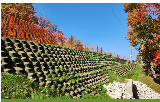
Completed Titan Earth Slope™ - Honey Comb system