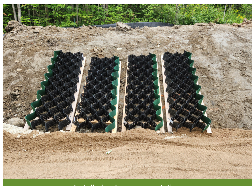
Installed system pre-vegetation