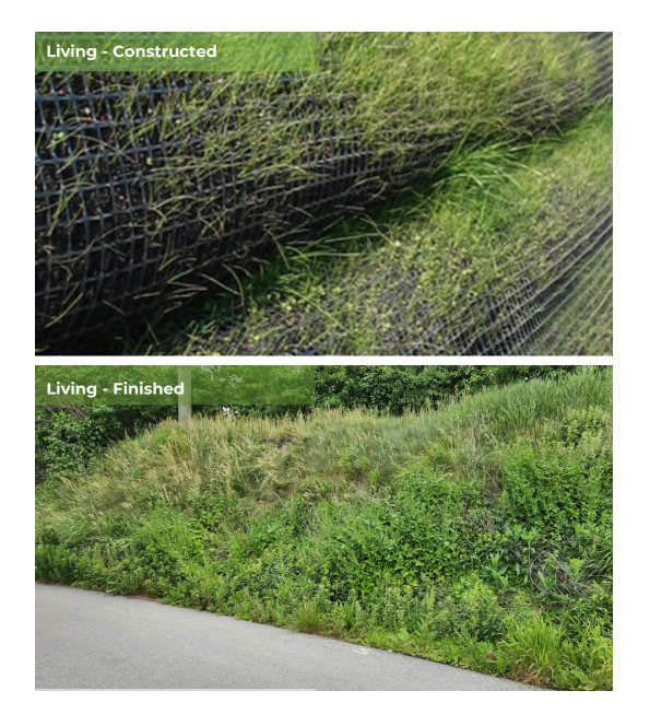
Titan Earth Slope™ - Living