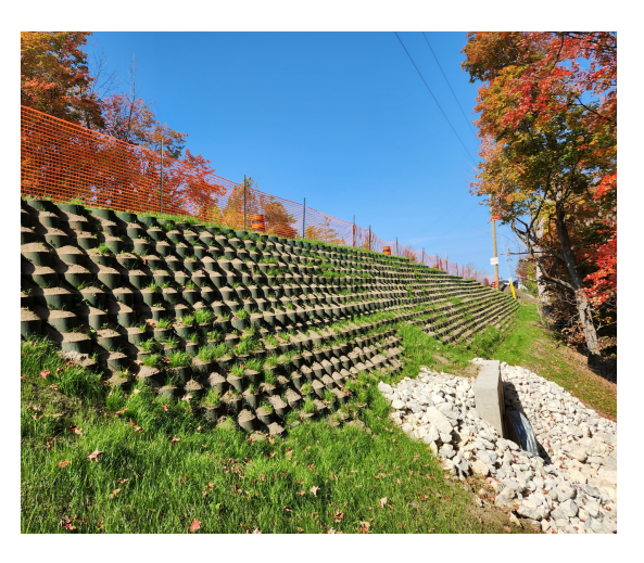
Titan Earth Slope™ - Honeycomb System