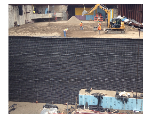
Titan Earth Wall™ - Tempus