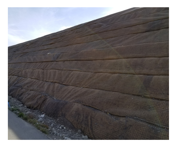
Titan Earth Slope™ - Grid System

Titan Earth Slope<sup>TM</sup> - Grid system is Ideal for MSE slopes up to 45 degrees. The system uses uniaxial geogrid in conjunction with a UV stabilized biaxial geogrid and erosion control blanket, wrapped to provide a robust and durable facing.