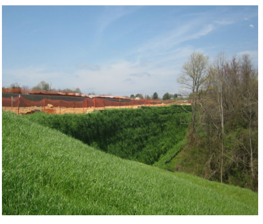
Titan Earth Slope™ - Veggie Finished

Titan Earth Slope™ - Veggie Illustration