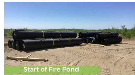
Start of Fire Pond