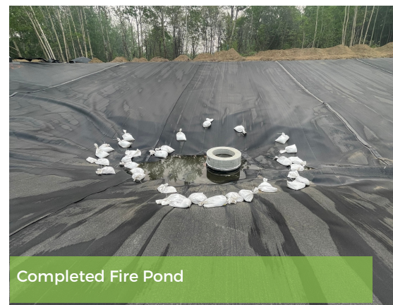
Completed Fire Pond