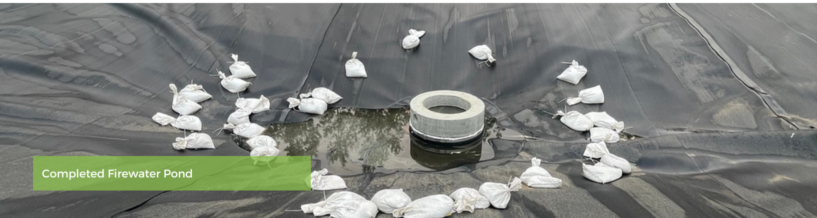
Completed Firewater Pond

I must say I am very satisfied with the robust system we had you price and install. It looks great and understand that this, along with the testing will provide us with one of the best pond liner systems available. Much appreciated, Developer".