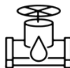
WATER & WASTE MANAGEMENT