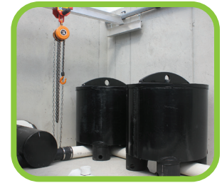
Chain Hoist System