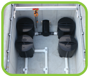
Vault Internal Assembly

For more information please see the BaySaver website at www.baysaver.com or contact 1-800-229-7283.