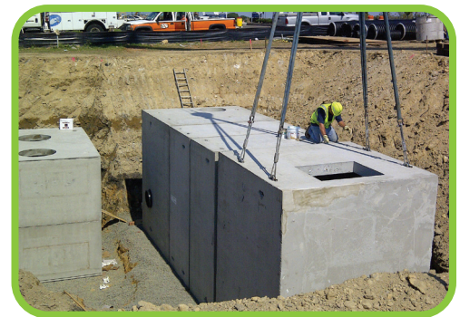
Vault End Section