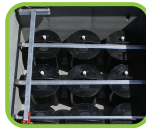
BayFilter Vault Overview