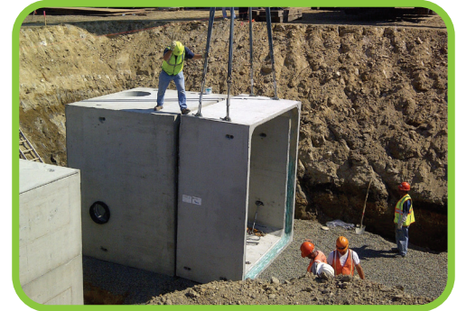
Modular Vault Assembly