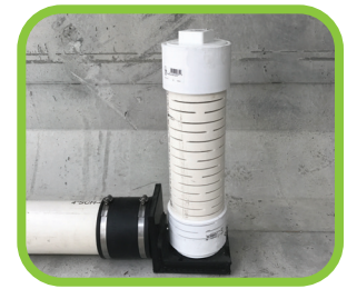
Drain Down Module