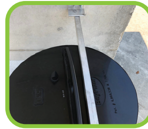
Hold Down Bar and Bracket