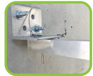
Hold Down Bar Bracket