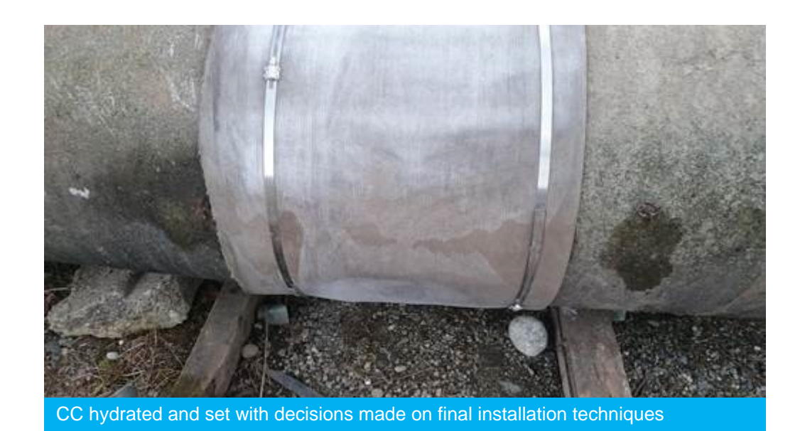
Various securing methods tested