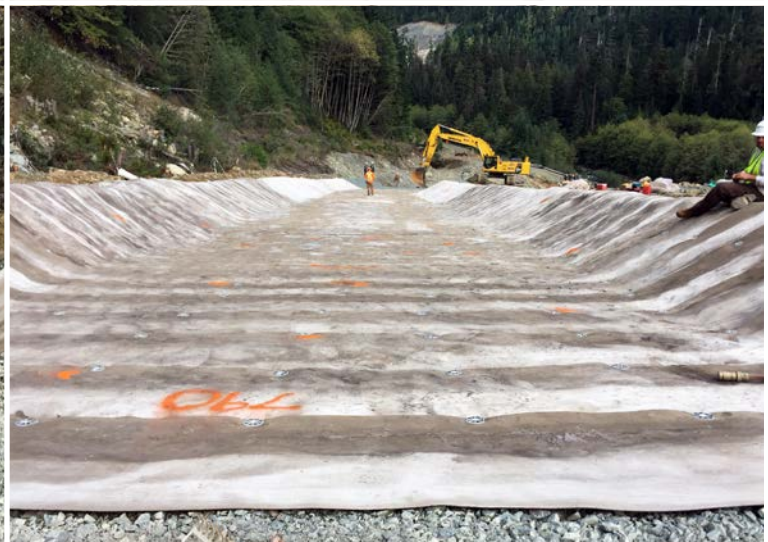
Spacing of percussive anchors through overlapped CC8™ layers