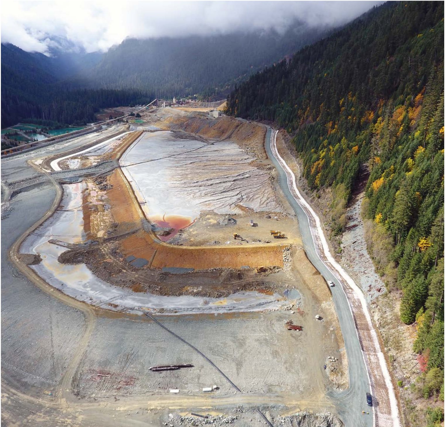
Aerial footage showing completed CC lined channel in relation to the mine