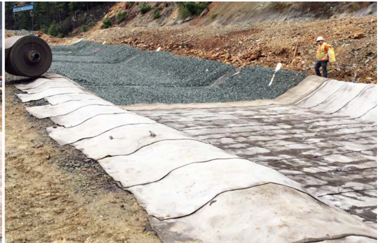
Anchor trench prior to backfilling