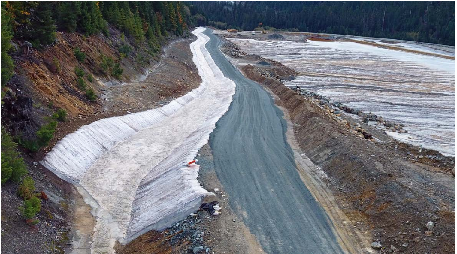
Aerial view of the mouth of the channel showing transition anchor trench