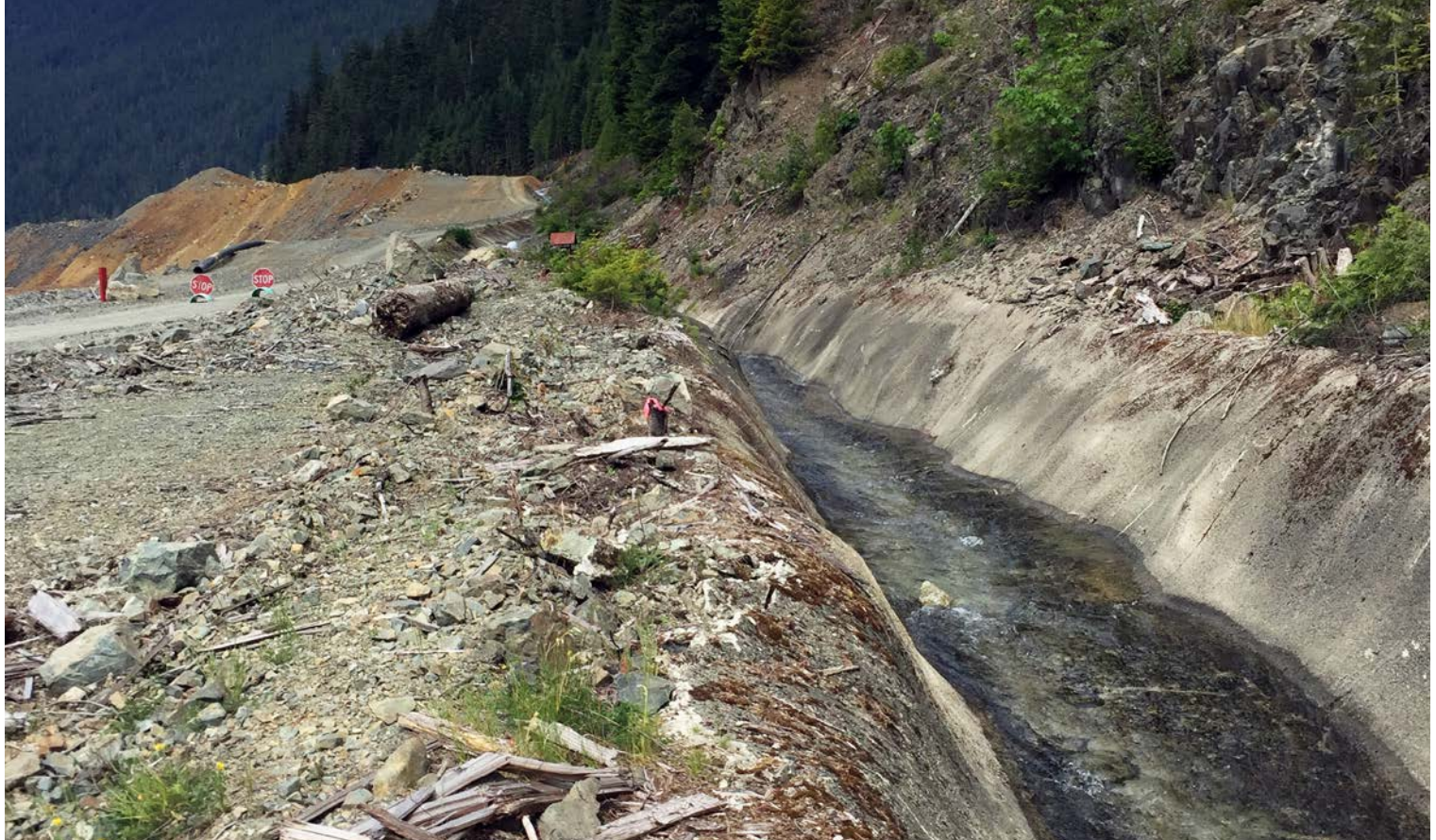
Previous channel section originally lined with shotcrete and showing signs of degradation

The material was hydrated using a water truck and due to CC having a very low wash out rate and low alkaline reserve, treatment of the run off from installation was not required. CC has a working time of approximately two hours from hydration, meaning that work can continue even in very wet conditions. This can reduce programme disruption typically caused by bad weather when using traditional solutions.