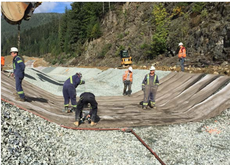
Screwing overlapped joints at 150mm centres