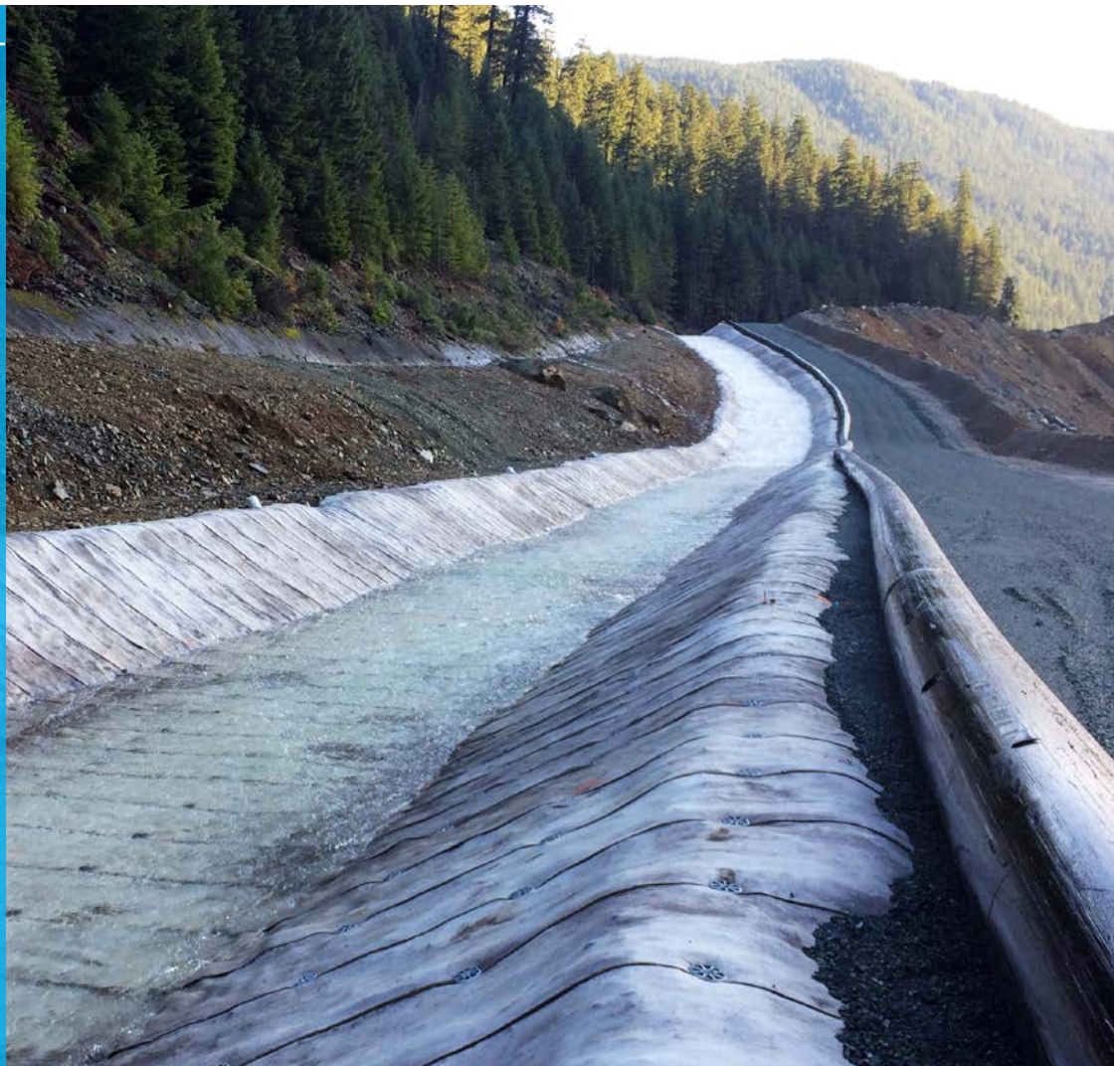
Completed CC lined channel with high flow 5 weeks after installation

CC lining of a large diversion channel at an underground zinc and copper mine in Canada.