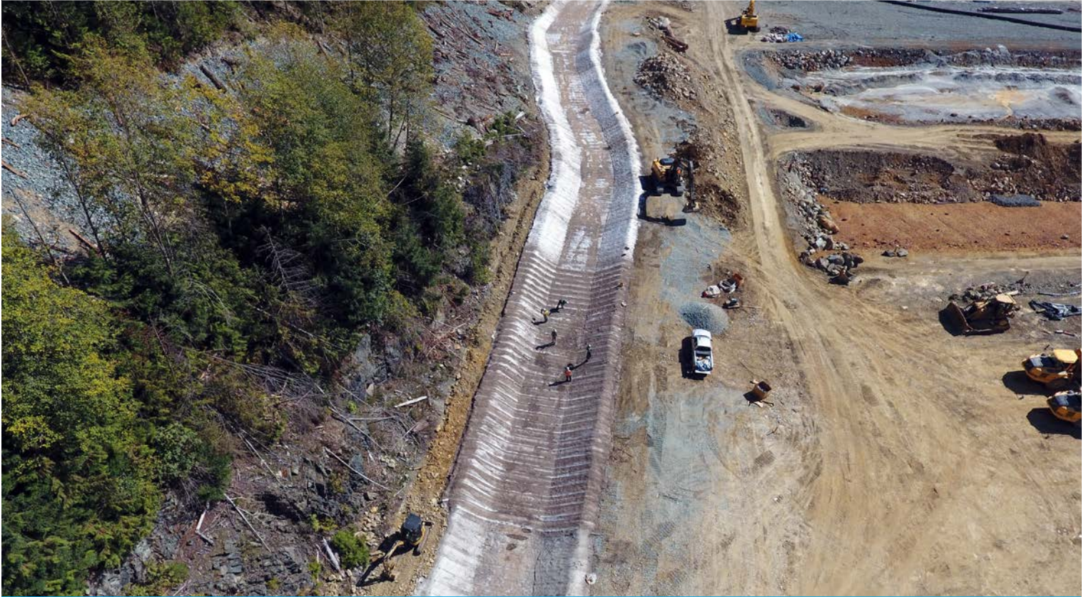
Aerial view of installation