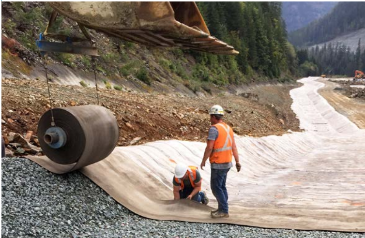
Dispensing of bulk roll CC8™ via spreader beam mounted onto excavator