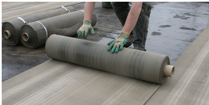
CC Batched Rolls