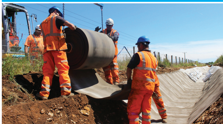
CC Bulk Roll