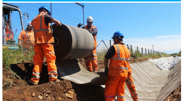
CC Bulk Roll