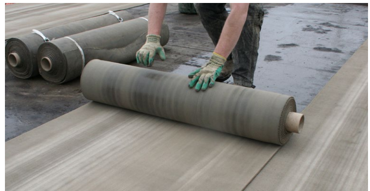
CC Batched Rolls