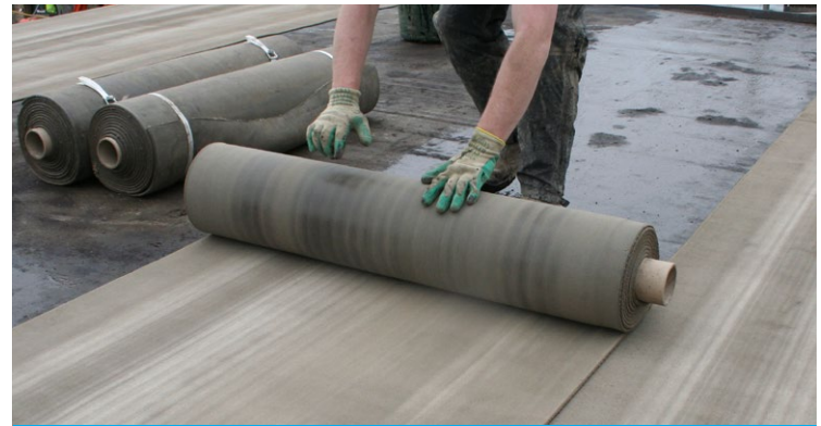
CC Batched Rolls