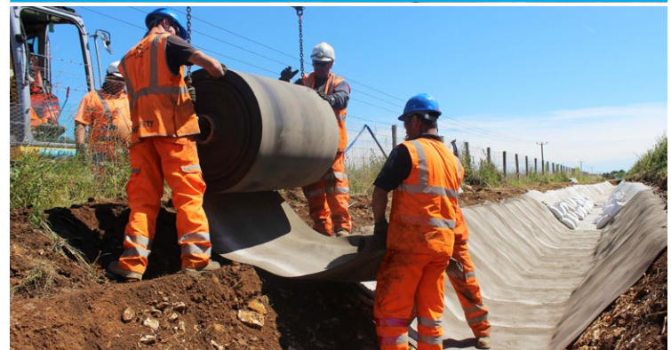
CC Bulk Roll